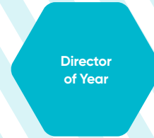
Director of Year